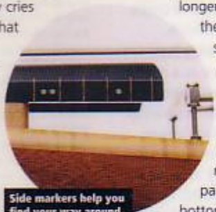
Side markers help you find your way around the fretless board

One ingenious addition to the bass is a small bracket at the top of the body under the support. This can be rested on a small hook that fits onto any standard mic stand. Figuring out where to rest a double bass can be the