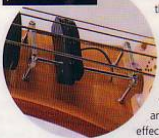
Sliding pickup helps you achieve your preferred sounds